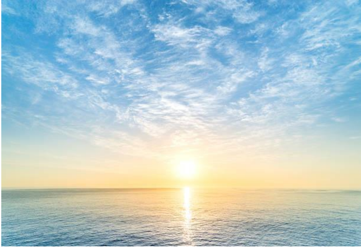
Morning Has Broken